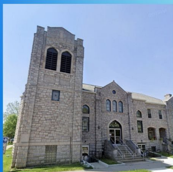
St. John's UCC, Tiffin