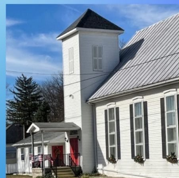
Zion UCC, Bettsville

Trinity UCC 131 E. Perry St. Tiffin, Ohio 44883